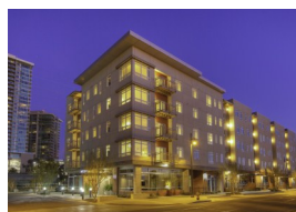
Encore on Farmer, Tempe, AZ Developer: Urban Development Partners/ PacifiCap Properties