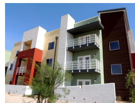
Grandfamilies Place, Phoenix, AZ Developer: Tanner Properties