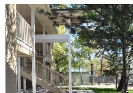
Rainbow Lake Apart- ments, Lakeside, AZ Developer: Hope Development