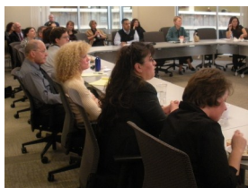
Alliance members attend Brown Bag Lunch.

"Being a member of Arizona Housing Alliance has allowed Habitat for Humanity Central Arizona to stay abreast of current issues and opportunities in affordable housing, to build relationships and partnerships, and to leverage our resources so that we can serve our community better."